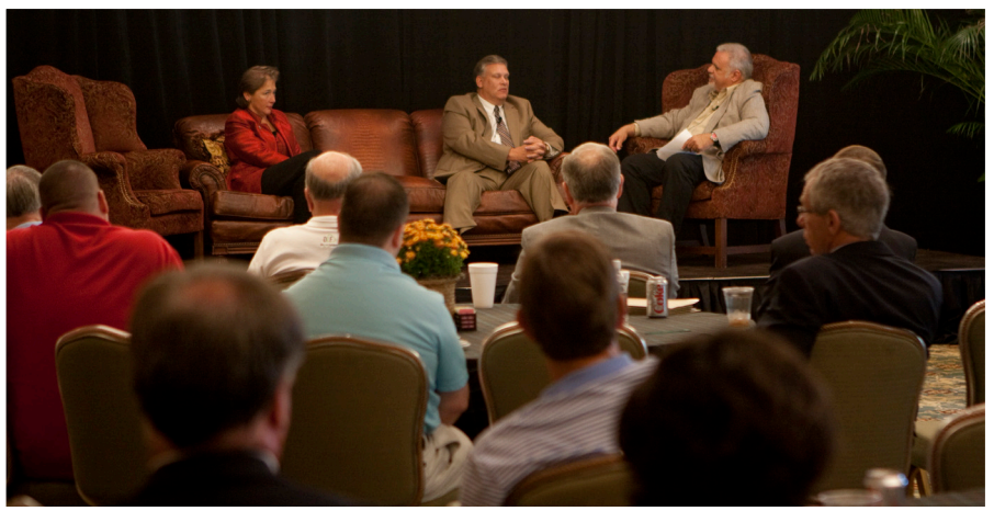
Top: Guests enjoying "Biscuits and Business" breakfast session at Sea Island's Retreat Golf Club.

Once BGCDA made the decision to utilize the McGladrey Classic as the basis for a fam tour, the wheels immediately went into motion to create a signature event that could be replicated in future years. With that, the Golden Opportunity Tour was born. Organizers of the newly named event began to structure an event that included a desirable mix of business and leisure activities.