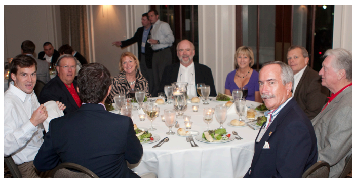
At left: Golden Opportunity Tour Guests and Hosts Enjoying Dinner and Music at the AW Jones Heritage Center.

"In addition to hosting our guests at BGCDA's skybox on the 18th green, we structured a session we called Biscuits and Business which included CEOs from area industries as well as the leaders of the College of Coastal Georgia, Southeast Georgia Health System and the Jekyll Island Authority.